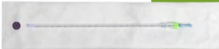
Sterile Kit with Single Marker in Needle