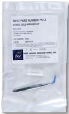
Sterile Kit with 5 Markers (Loose)