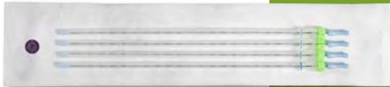
Sterile Kit of 4 Needles with Marker in Each